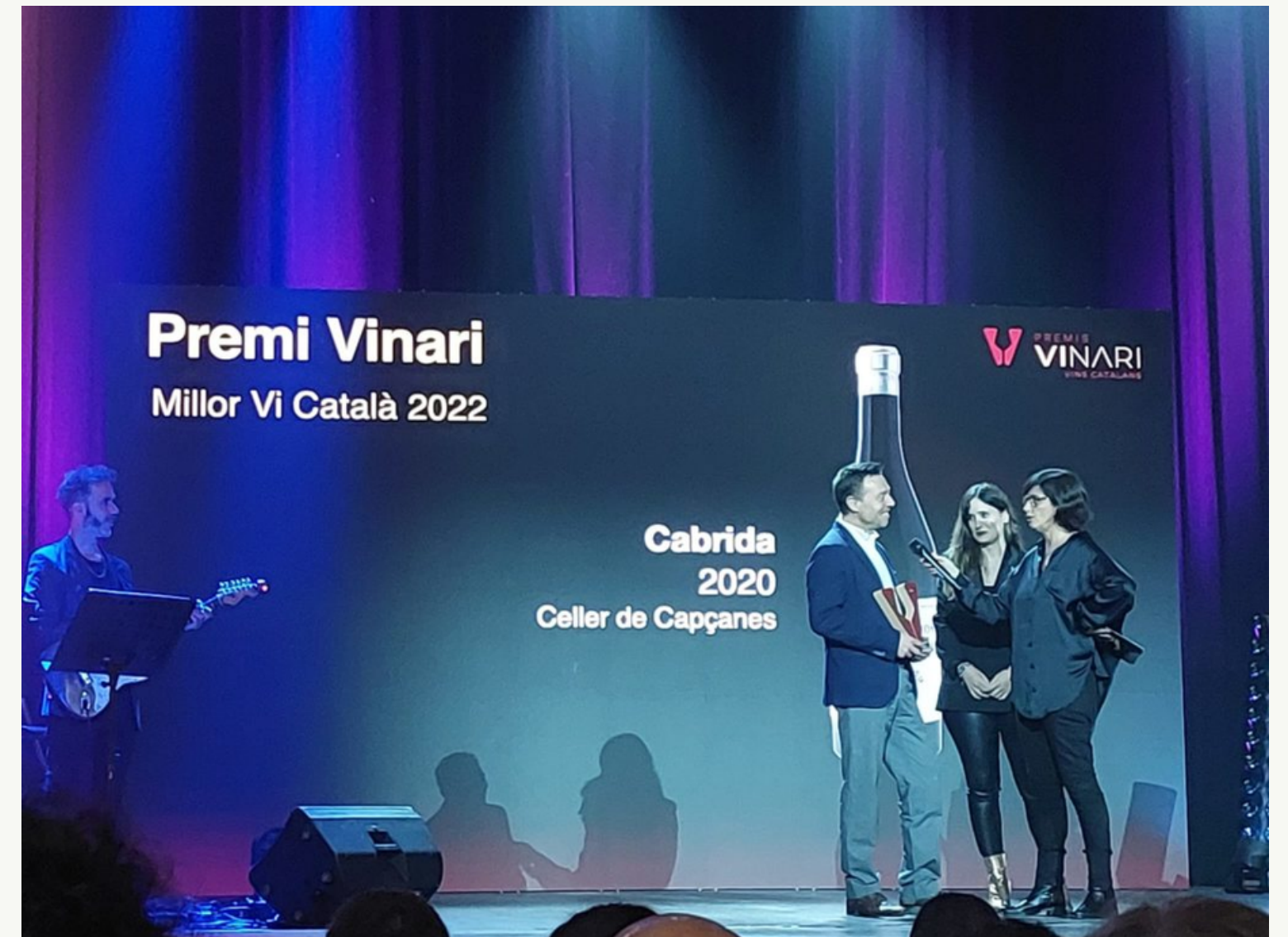
Best Catalan Wine of the Year goes to Cabrida Vinari Awards, Barcelona

For " La Nit de les Garnatxes Llicorella " (slate soils)