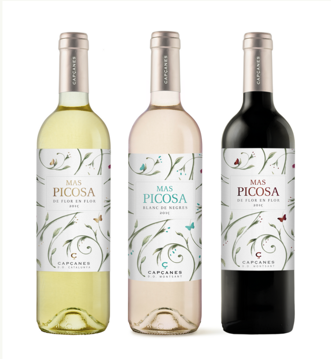
Mas Picosa, 100% Vegan & Organic certified

In addition, 30ha of our crops have already obtained the 100% organic production seal from the European Union.